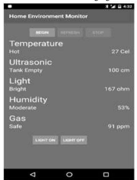
Figure 4 Client Side Android Application

The Android mobile application provides a simple user interface to display the home conditions of the user at his fingertips. It also shows comments as text and the actual sensor values. The user receives push notifications in case of emergency situations such as gas leak and alerts the user when customized requirements are met such as water tank being full and refrigerator being left open. The Application also provides the option to control the home lighting by switching on and off the lights of the home from the mobile application. A screenshot of the mobile application can be seen in the following figure.